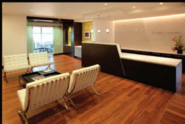
Clark Nexsen :: Roanoke Office - Pending LEED Certification